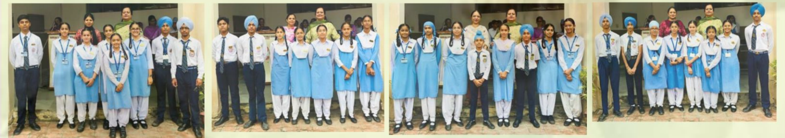
IX - A