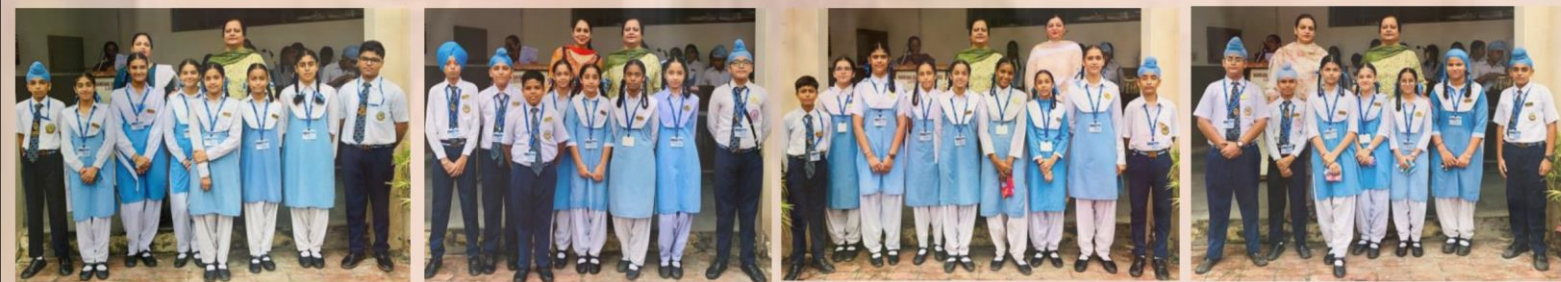
VII - A