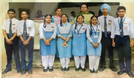
IX - E