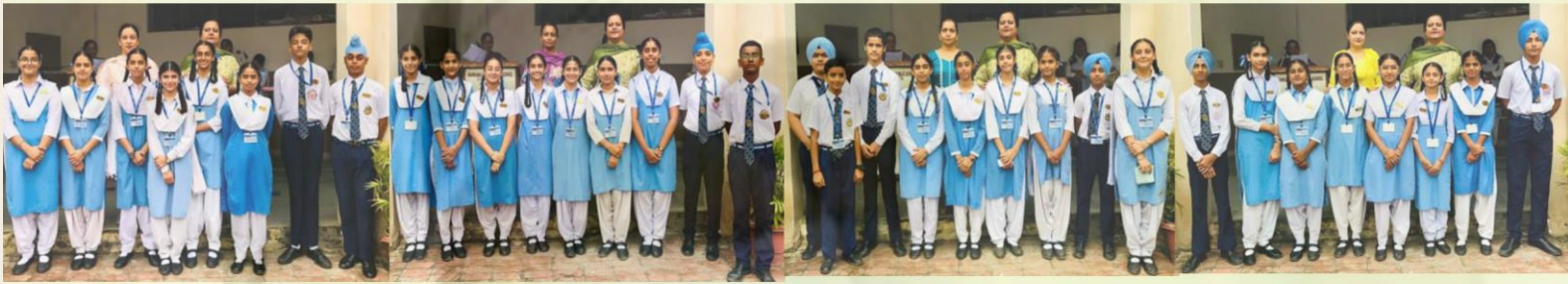
VIII - A