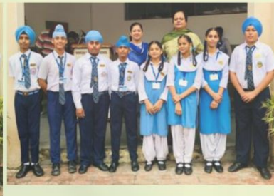
VIII - F