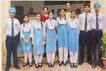
X - E