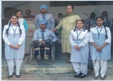
XII Sci. A