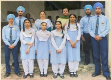
XI Arts A