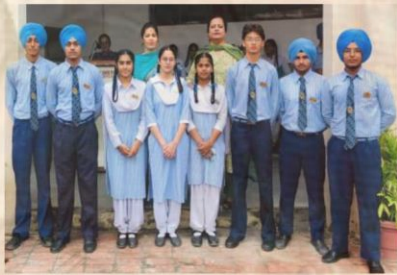
XI Comm. A