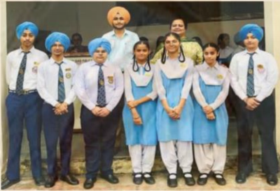
X - D