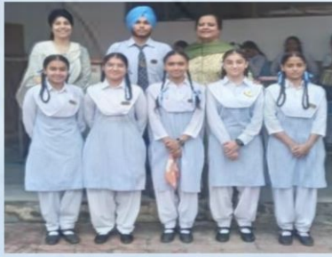
XII Comm. A