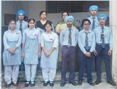
XII Arts A