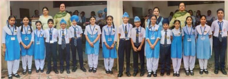
VI - E