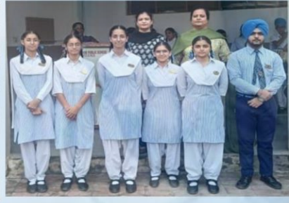
XII Comm. B