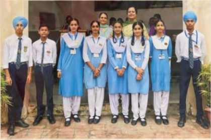
X - A