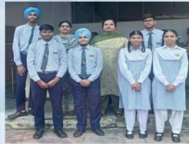
XII Sci. B