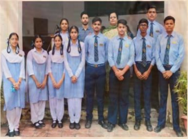
XI Comm. B