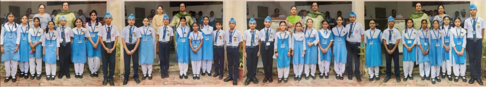
VI - A