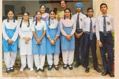
X - C