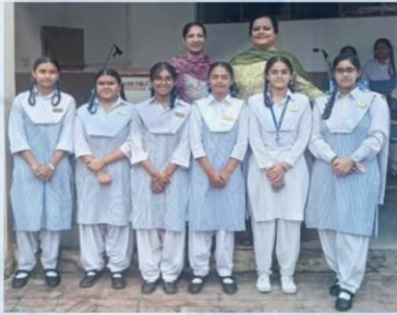
XII Arts B