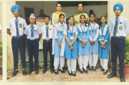
VIII - G