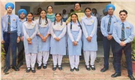
XI Sci. A