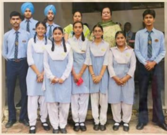
XI Arts B