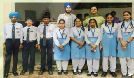
IX - F