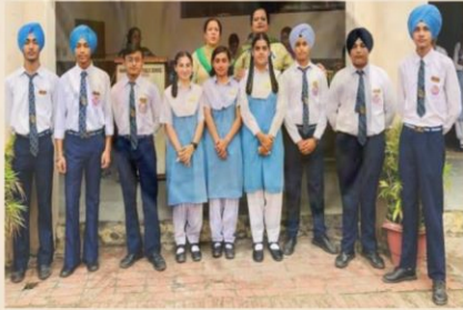
X - B