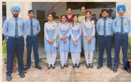
XI Sci. B