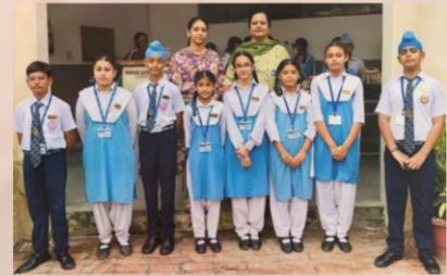
VI - G