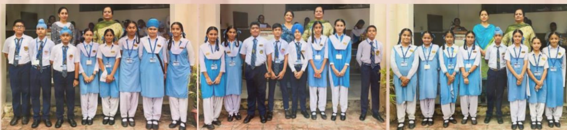
VII - E