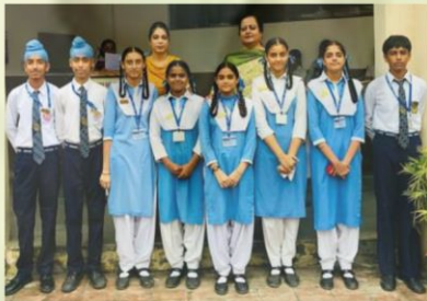
VIII - E